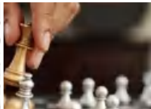
CHESS & CARROM ROOM