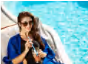
ADULT SWIMMING POOL