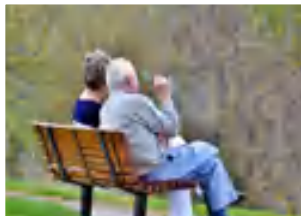
SENIOR CITIZEN SEATING SPACE