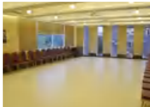
AC MULTI-PURPOSE HALL