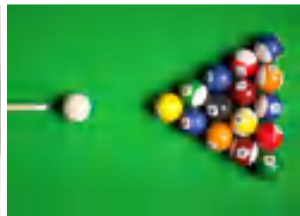
T. TENNIS & BILLIARD