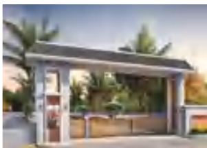
DESIGNER ENTRY GATE