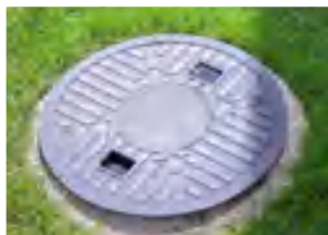
COMMON SEPTIC TANK