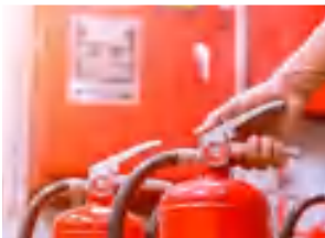
FIRE FIGHTING SYSTEM