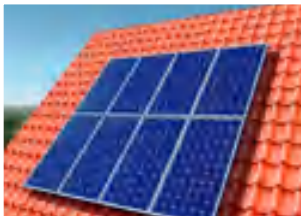
SOLAR FOR COMMON AMENITIES