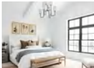
6 FURNISHED GUEST ROOMS