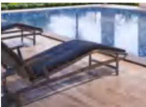
DECK WITH SEATING