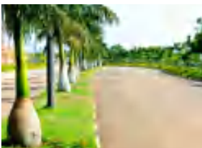
WIDE RCC ROAD BOTH SIDE PAVING