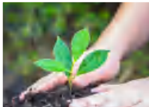
PLANTATION IN CAMPUS